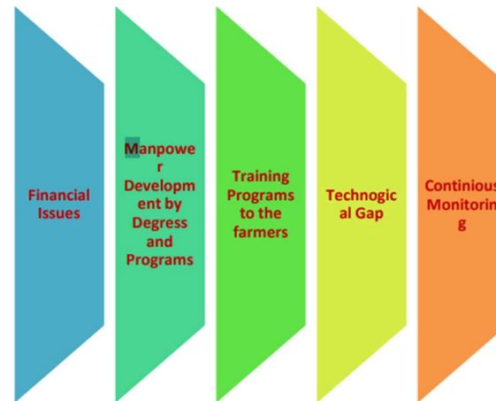
Fig.3 Major issues and concern on Agricultural Robots and technologies