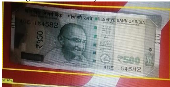
Fig. Processed image

Now the range suggested by RPN will be given as an input to another completely associated neural network and speculate bounding boxes as well as object class.