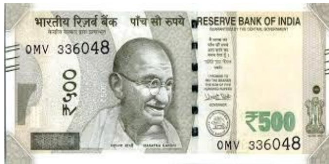
Fig. Original note

To recognize the nation of currency, the banknotes have been segmented into the groups on the basis of blank region's presence and absence. Then, the banknotes will be classified by performing the template matching from the already stored templates that identifies the banknotes from the countries in the each group. For demonstration purpose, the Indian 500 rupee note is chosen. It is shown in below figures, before and after preprocessing steps of country as well as the denomination of the note. The dataset upon which our system is trained, comprises of some of the most common currencies, but this dataset can easily be increased by using the same approach we have previously described. As observed that our system is capable to identify the denomination and country of the currency in approx. 5-6 seconds, which is considered as an improvement. As there are more than 150 currencies present in the world, but our system is concerned about few of the most commonly used currencies, but the number of different currencies to be recognized can be increased. Our system is not much efficient to recognize the damaged currencies which can be worked on in future.