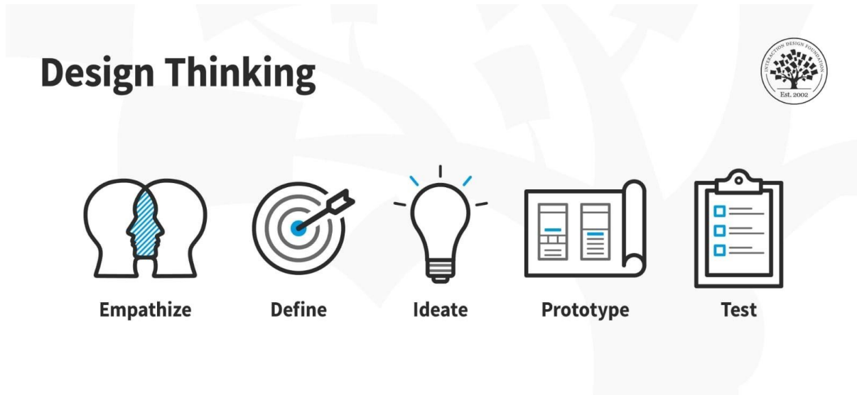
Fig 1. Steps of Design Thinking

● Test: This is putting the prototype to the test. This checks whether the solutions solve the problem or not. If it doesn't then we go back and start again. Testing allows the team to see how well the solution works in the real world.