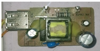
Fig.2. Adaptor module

A power supply system is defined as a system that provides electrical energy to the load connected. In this system we need a 5V DC continuous power supply, for this, we require a rectifier, filter circuit, step-down transformer and voltage regulator. Fig.2 shows a normal charging module that includes all the above-mentioned components.