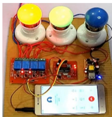
Fig. 5 Connection of System

Fig. 5 illustrates the connection of the whole system. If the user dials the home mobile phone number, the phone at the home starts to ring and if in case nobody picks up the voice call, then the system automatically picks up the call. When we push any number on the phone keypad it generates a distinct particular frequency later which is when received by phone at the other end and then the number is further decoded by the DTMF decoder (MT8870). Here the decoder in the circuit decodes the unique frequency of the tone obtained by the particular number. The DTMF decoder circuit generates a binary output as a response of key pressed which is then forwarded to the microcontroller. Here the microcontroller activates/switch ON the relay module and in accordance with the key pressed by the other side over call. A 4-channel relay module is connected between the microcontroller section and the loads attached. It drives the appliances based on the output out of microcontroller. Thus, when the relay drive is triggered by the microcontroller, the device will get ON or OFF as per the user's requirement.