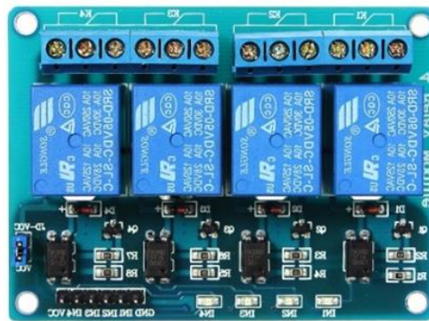
Fig.4. Four-Channel Relay module

In this setup, the relay module is a device that allows us to switch ON or turn OFF a circuit. Fig.4 shows a picture of a 5V 4-channel relay. It contains four 5V relay and it is easy to interface with a microcontroller or any sensor. This relay interface needs a 15-20mA driver current. Four-Channel Relay Module can be used to control numerous home loads and equipment with a huge current rating. It can be established as a central hub from which various remote loads can be operated. Each relay connected on the board.