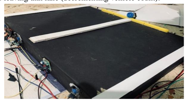
Figure 1:Project Prototype

In this module, we have used IR sensors for detecting traffic congestion and Dc motor for moving the divider. Both of the above-mentioned hardware is controlled by using Arduino Uno. To be more specific regarding detecting traffic, In our prototype we've placed four IR sensors on each lane of road and there are total two lanes in our prototype i.e. Incoming and Outgoing lane. In each lane, first two IR sensors are used to detect the vehicle coming into that lane (incrementing vehicle count) and the two IR sensor which are placed at the end of the lane are used to detect the vehicles leaving that lane (decrementing vehicle count).